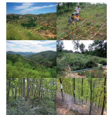
开辟生态系统过程与服务研究新方向 Linking ecological processes with ecosystem services