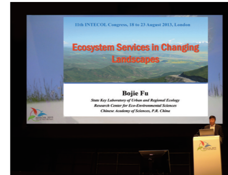
傅伯杰院士2013年受邀在伦敦召开的第11届国际生态学会大会作特邀报告 Professor Fu Bojie gives a plenary speech in the 11th INTECOL congress in London in 2013

全国生态系统服务评估及其政策应用 National ecosystem service assessment and its policy application in national ecological redline designation