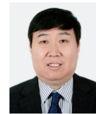
傅伯杰 Fu Bojie